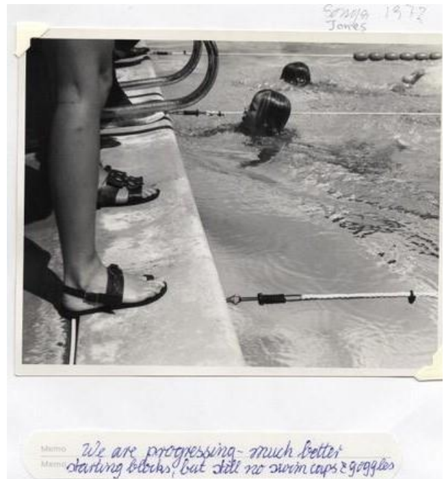
1977 – progress, but still no goggles