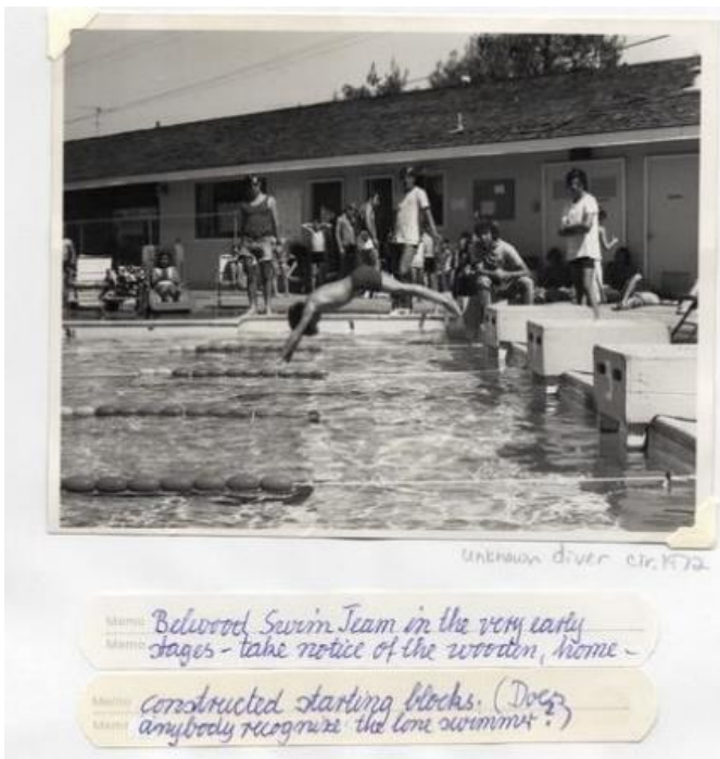
1972 – The early days -wooden, home constructed starting blocks

Belwood has been part of the Valley Cabana Swim League since 1999. The other teams in the league include: Almaden Country Club, Los Paseos Aquatic Club, Montevideo, Oaktree Park Swim Team and Silver Creek Country Club.